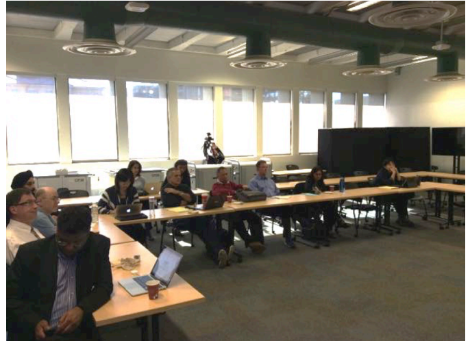
November 06 “Learning from your Peers” Event Participants