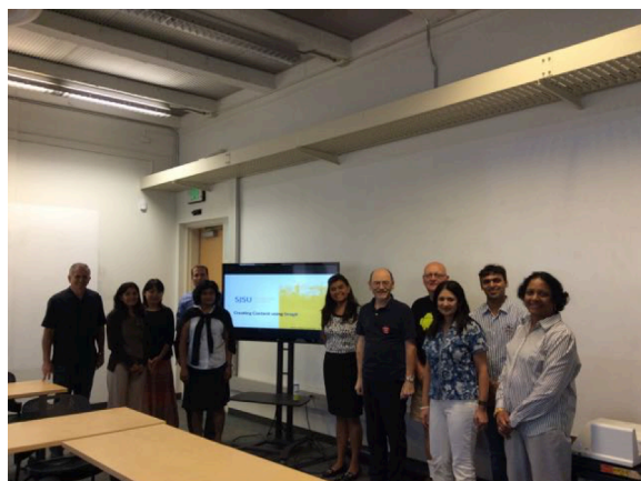
October 09 “Building Course Content using Snagit ” Workshop Participants

Our November 20 workshop focused on “Providing Feedback using Rubrics, SpeedGrader & CrocDoc, and Turnitin .” Canvas allows for the use of these tools to provide student feedback effectively. Turnitin is an