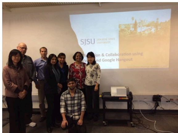
November 13 “Interaction & Collaboration using WebEx and Google Hangout ” Workshop Participants