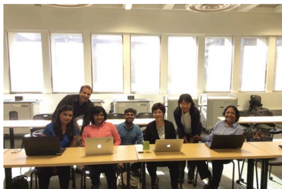
October 30 “Building Course Content using Camtasia ” Workshop Participants