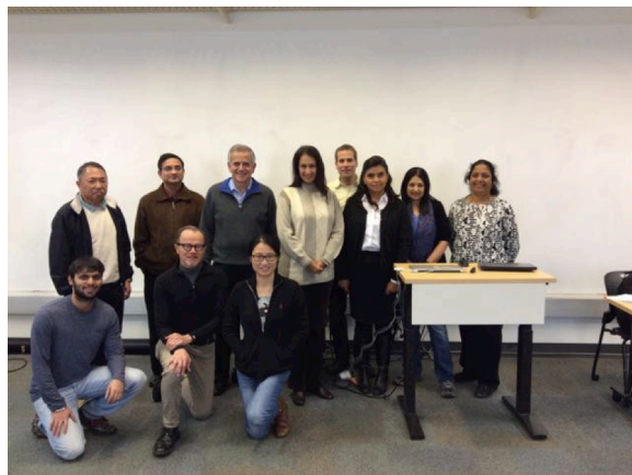
December 04 “Soliciting Feedback using Qualtrics and Google Forms” Workshop Participants

Our final workshop of the Fall 2015 semester focused on “Soliciting Feedback using Qualtrics and Google Forms”. Qualtrics is a survey software. Google Forms is a simple application that helps collect information in an easy and streamlined way.