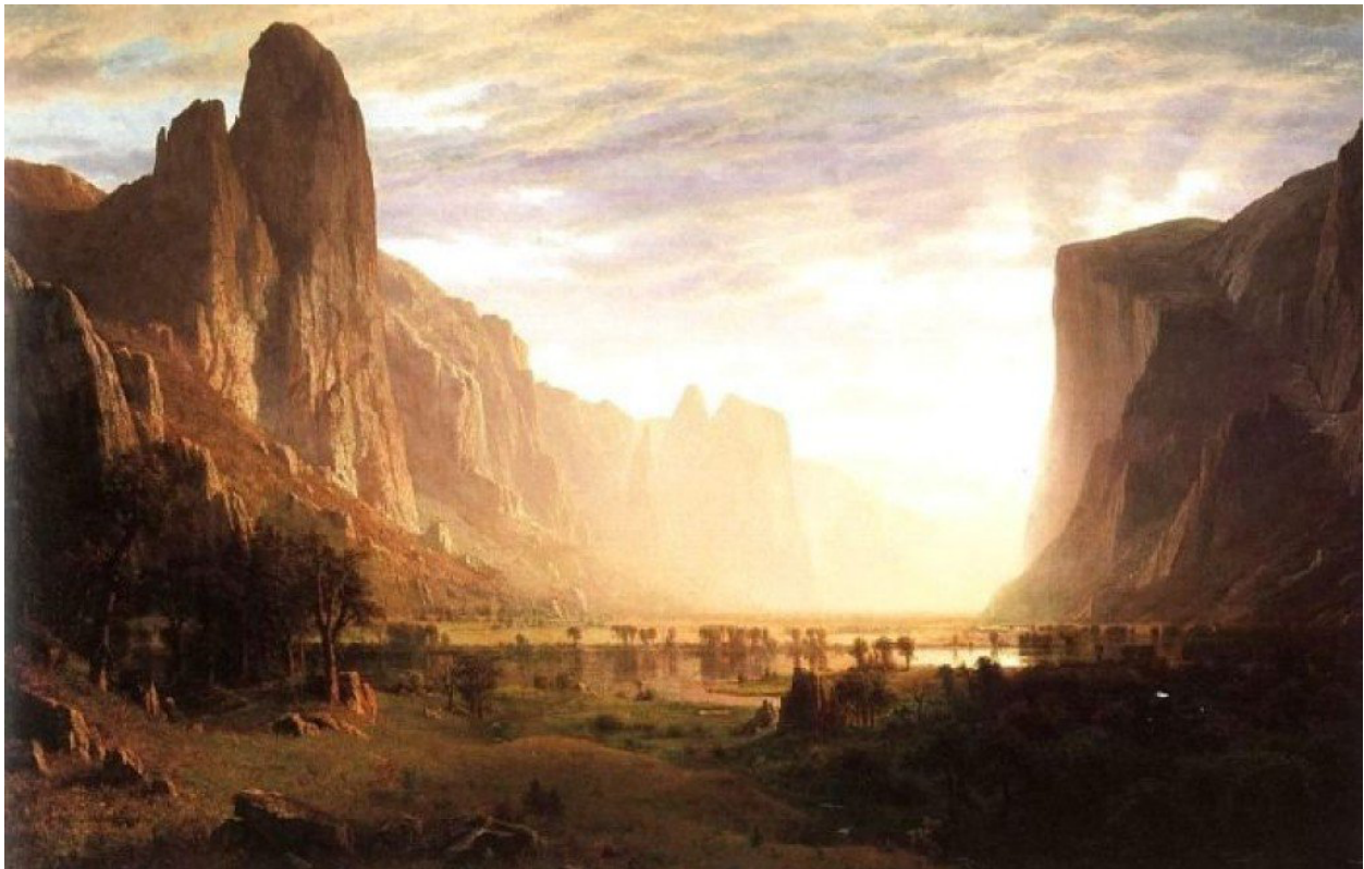
Alfred Bierstadt, “Looking Down Yosemite Valley, California”

This course of first-year writing is an introduction to academic rhetorical analysis and writing skills through an exploration of unique and varying perspectives on American literary renaissances. “Renaissance” means a rebirth—a reawakening. How do we define and understand this in context to American literary culture? How can we ascertain and determine periods of American Renaissance? Moreover, what can we learn from studying them? This class explores the intellectual and cultural revolutions that have occurred in American literature since its foundation. By voyaging through canonical and non-canonical texts by notable authors such as Emerson, Thoreau, Poe, Whitman, Dickinson, Frost, Stevens, Eliot, Roethke, Sexton, and Plath, students will gain a comprehensive understanding of the inception and evolution of high art and philosophy that has shaped the creation and definition of American identity.