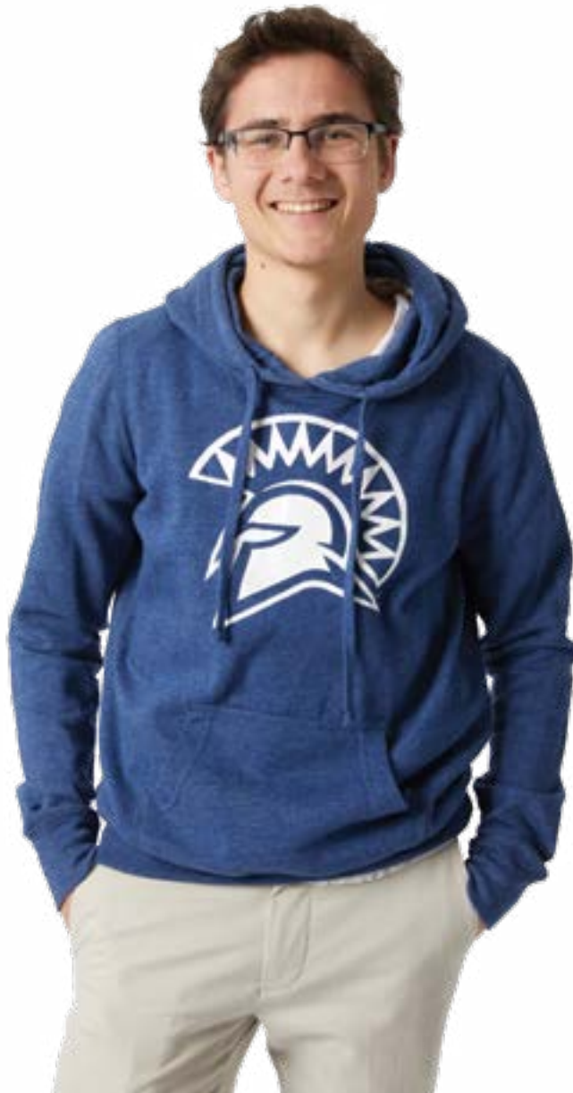
Nikola Biological Science/ Systems Physiology

Pay your enrollment deposit at https://nextsteps.sjsu.edu