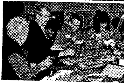
Guests enjoying food at the Circle of Friends reception