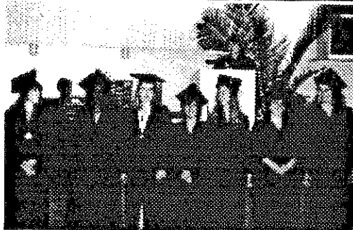
NuFS 1995 Graduates at Convocation