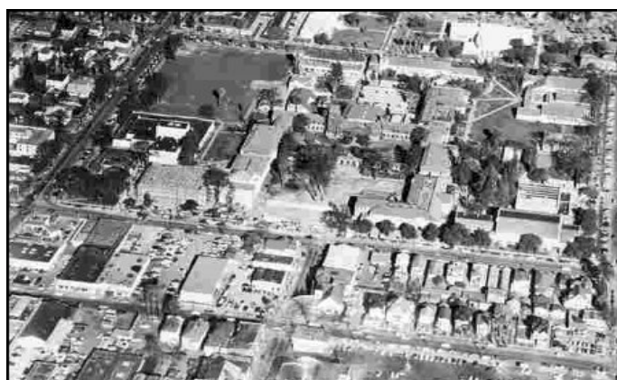
This 1955 aerial photo shows the Carnegie Library building(then the Student Union) in the lower lefthand (NW) corner of the campus. The Library Building(Wahlquist South) and the Library Annex (Wahlquist Central) lie to the right. The Clark Library was later built on a portion of the empty land shown at the top of the photo.

The school's library, beginning with a few hundred volumes, was housed in the Normal School Building from 1870-1910. In 1902, the Carnegie Public Library opened at the corner of Fourth and San Fernando Streets, the land having been donated back to the city by the Normal School. The site of the Carnegie Library was purchased back by the State College in 1936 and became the Student Union. The San José Public Library moved to Market Street and in 1990 the main public library was dedicated at its current location.