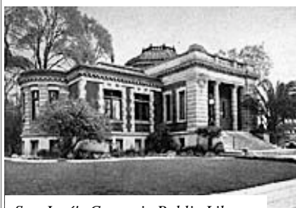
San José's Carnegie Public Library at Washington Square (1902-1936)

Starting in 1910 the College's library was housed in the north wing of Tower Hall until a Library Building was completed in 1941 at Fourth and San Antonio. In 1956 the Library Annex was added and Library North opened in 1961. The new Clark Library building was completed in 1981, but could not hold the entire collection, part of which remained in the old library buildings, renamed Wahlquist South, Central and North.