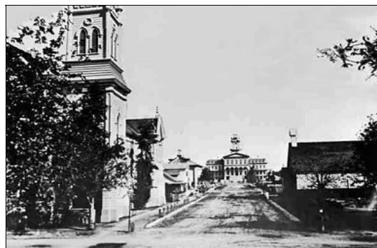
View of the California Normal School Looking Down San Antonio Street from Second Street