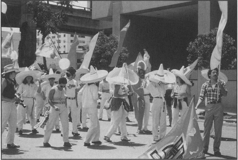
GALA's (Gay Latino Alliance) women's percussion group during San Francisco's Gay Freedom Parade, 1977.

speaking with a man who witnessed the military's tactics for the clean slaughter that took place, mostly of Native Americans. History in modern El Salvador began to die in 1932, indigenous cultural expression suppressed effectively from that moment onward; for the Hernández Martínez dictatorship, indigenous wear, language, and spirituality meant communism, meant a threat to deals between U.S. companies and Salvadoran oligarchy, and of course meant further repression. In the 1990s, in post-Peace Accords El Salvador, I wonder every time I visit who will finally turn the recorders on, and which survivors will be willing to dig deep against that erasure of their living and of their dead—my living and my dead.