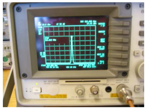
Figure 3.2. Transmitter output, centered at 915.2 MHz.