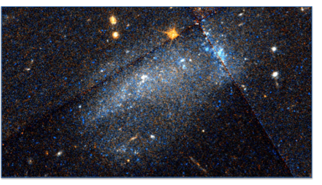
KKH 60 (AGC 201993): HST / WFPC2 image

The HST data for KKH 60 included filters F606W and F814W (similar to V and I ). This allowed us to create a color–magnitude diagram, after using the concentration index to select the point-like sources. The orange box below shows the region expected for old globular clusters.